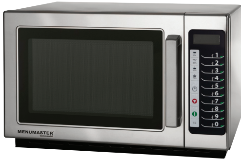
Model MCS10TS shown