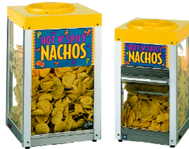
15NCPW 12NCPW Nacho Chip Merchandiser/Warmer

Star's Merchandiser Warmers are covered by a one-year parts and labor warranty.