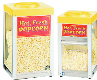
15NCPW 12NCPW Popcorn Merchandiser/Warmer